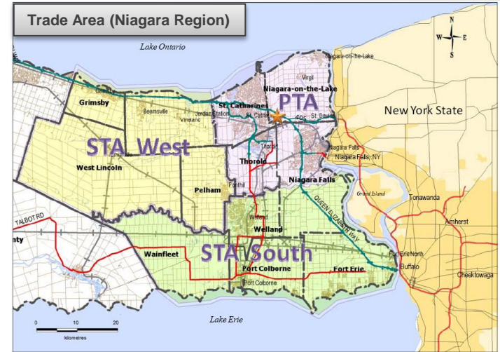
Shopping Centre Space per Capita